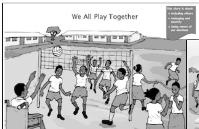
Grade 1-3 wall charts