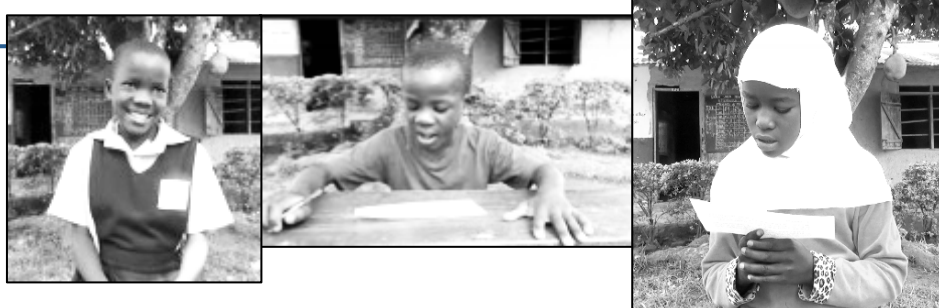
Figure 1: Ugandan primary school children participate in a language and literacy assessment exercise as part of the NCDC materials development process

Grades 6-7: supplementary readers, comprising stories on LTLT themes, discussion prompts for teachers and exercises for students.