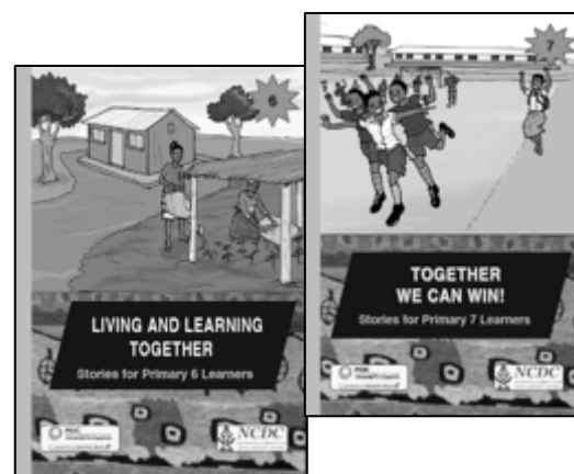
Grade 6-7 readers